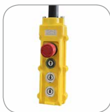
24v safety control 24v 安全电压操作