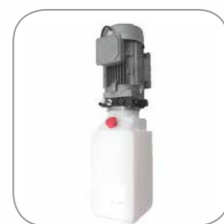
Aluminum motor 铝电机散热性能好