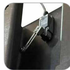
Height limit switch 上限位开关