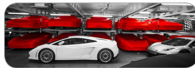
Parking space doubler 上下双层停车设计