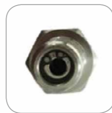
Safety valves against hose breaking 安全阀确保使用安全