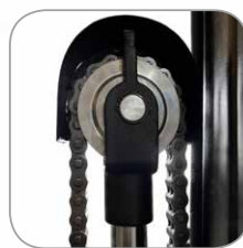
Chain protector design 链条防脱防夹手功能